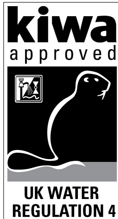
The KUKreg4 Certification Mark

Additionally, using the KUKreg4 Mark demonstrates that you have achieved independent third-party certification, providing your customers with confidence in your products and differentiating those products from market competitors.