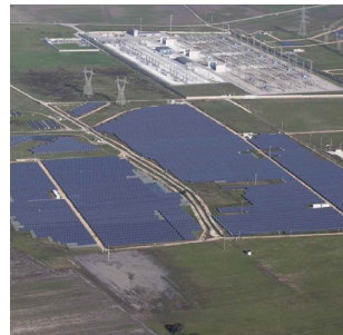
ITALY PHOTOVOLTAIC PLANT 85 MW