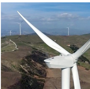
ITALY WIND FARM 60 MW