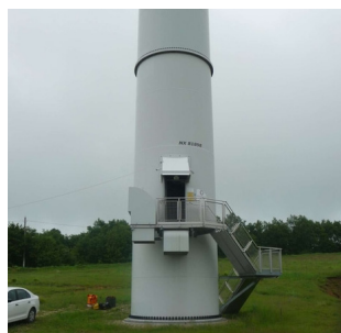
ROMANIA WIND FARM 54 MW