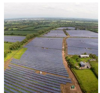
UNITED KINGDOM PHOTOVOLTAIC PLANTS 10 MWp