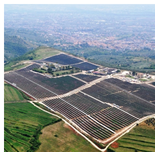
ITALY PHOTOVOLTAIC PLANTS 334 MW