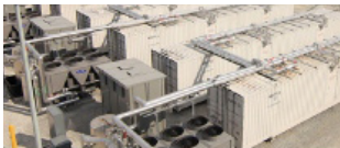
ITALY PHOTOVOLTAIC PLANTS 177 MW

Technical Advisory with study on H2 production and Storage implementation