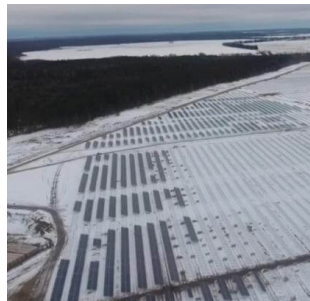
BELARUS PHOTOVOLTAIC PLANTS 130 MW