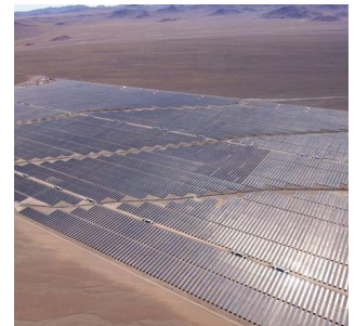
CHILE PHOTOVOLTAIC PLANT 97 MW