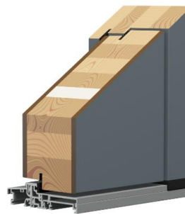
Figure 2: 76/105 wooden panel door