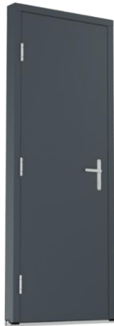
Figure 1: 76/105 wooden panel door