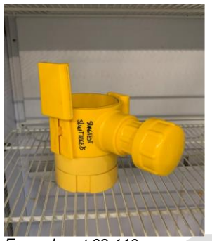
Example set 63-110 mm