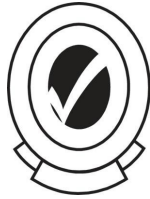
PMS 7463 C CMYK: C=40 M=13.6 Y=0 K=0.8

3.2 The following guidelines govern full color reproduction: