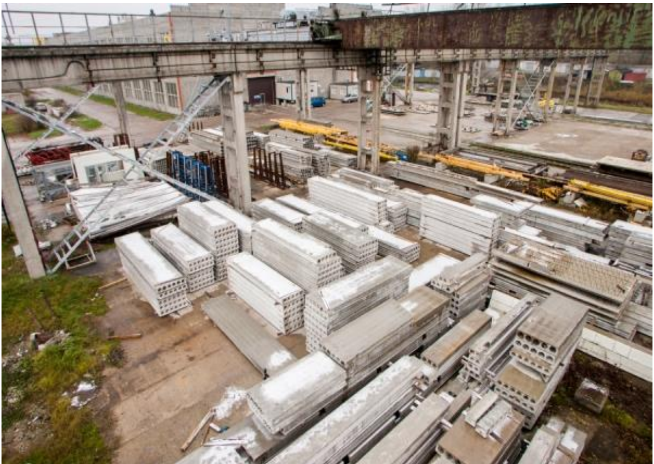
Hollow core slabs