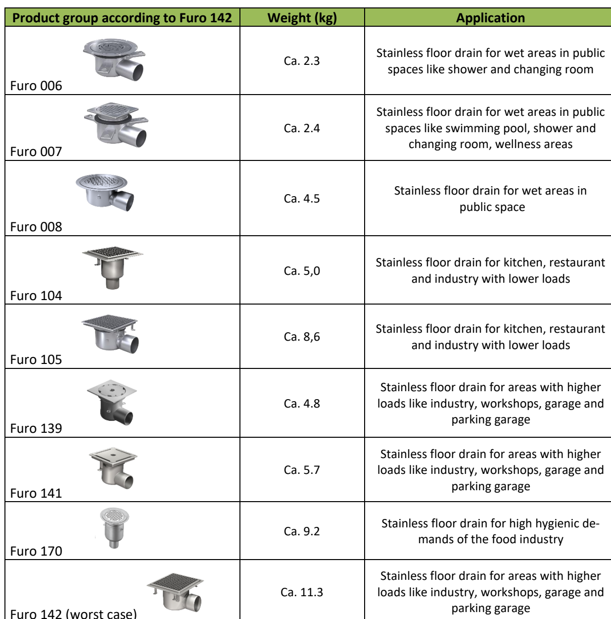
Table 1: Declared floor drains product group

These products were grouped together since they are similar in material and application.