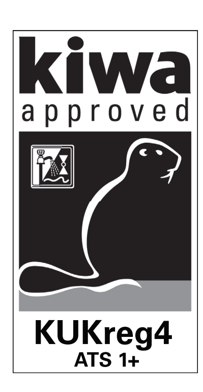
The KUKreg4 Certification Marks